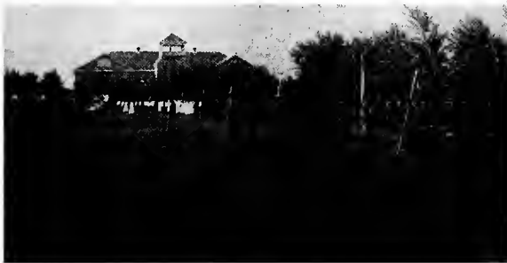
INDIAN YOUTH BROUGHT TOGETHER IN GOVERNMENT SCHOOLS

The young American Indians eagerly respond to the ideals and program of the Association. Their participation in the Student Movement leads naturally and inevitably to the vision of life service among their race. Already they are filling positions of Christian leadership and have caught the vision of evangelizing the great Indian population of South as well as North America.